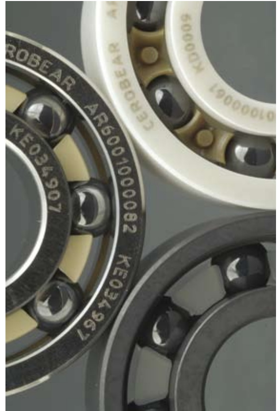
CEROBEAR hybrid and ceramic bearings

Although supplying products on top of today's rolling bearing technology, CEROBEAR's engineers are always looking for innovation in bearing design, material and performance. Every year CEROBEAR spends more than 10% of its revenues for research and development projects.