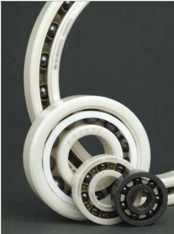
CEROBEAR ceramic bearings for semiconductor production machinery

Superlative corrosional resistance, no particle emission and zero maintainance characterize bearing requirements for applications in semiconductor manufacturing. 90% of all microprocessors and DRAM chips worldwide are produced with machinery equipped with CEROBEAR ceramic bearings. The often more than ten times gain in lifetime compared to conventional bearings drops the cost of ownership of the capital investment substantially into those limits this mass-production industry needs.