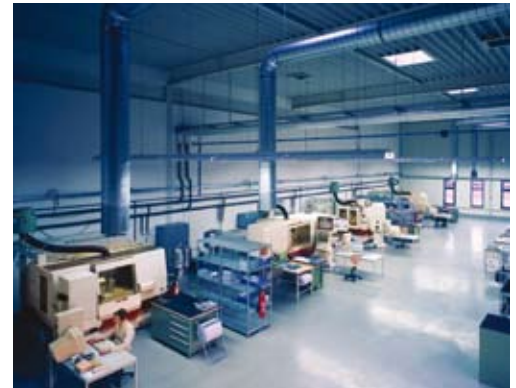
View into CEROBEAR production

CEROBEAR operates an impeccable 2400 m 2 /26000 sqft facility with state-of-the-art production, metrology and testing equipment, and we have a staff of more than 100 highly skilled technical employees.