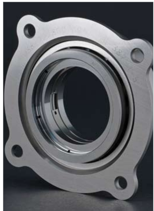
CEROBEAR hybrid bearing with flange for high-speed applications