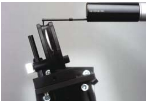
Curvature inspection of an inner raceway.