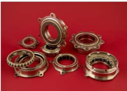
CEROBEAR hybrid bearings for the use in accessory gearboxes

Today satellites, servo actuator and auxiliary power units, gearboxes and accessories in aviation and space take advantage of the low weight, low torque and superlative reliability of our bearings.