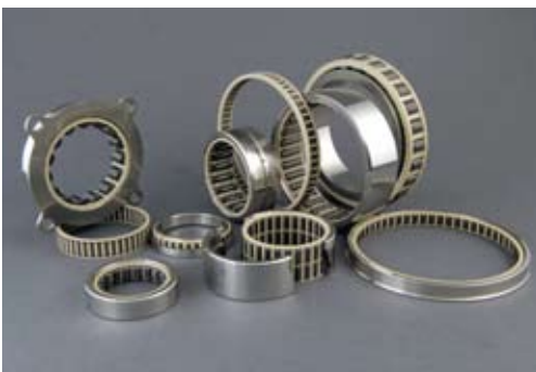
CEROBEAR race-car gearbox bearings