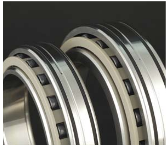
CEROBEAR silicon nitride cylindrical rollers are the key elements for high-speed hybrid roller bearings

Even more speed than in motor racing is required from bearings for machine-tool spindles since speed is directly equivalent to productivity. With its unique ceramic grinding and polishing technology CEROBEAR has concentrated on superprecision hybrid cylindrical roller bearings, which can improve the radial spindle stiffness more than 3 times compared to ball bearings - without any rpm-restrictions. In many applications, oil lubrication can be substituted by a lifetime grease package – which CEROBEAR supplies with our custom-designed sealed bearings.