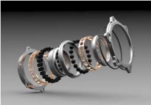
CEROBEAR Formula 1 hybrid bearings