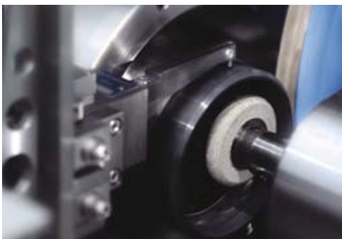
Simultaneous inner and outer diameter grinding of a silicon nitride bearing race.